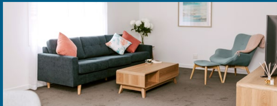
1 Bedroom Apartment