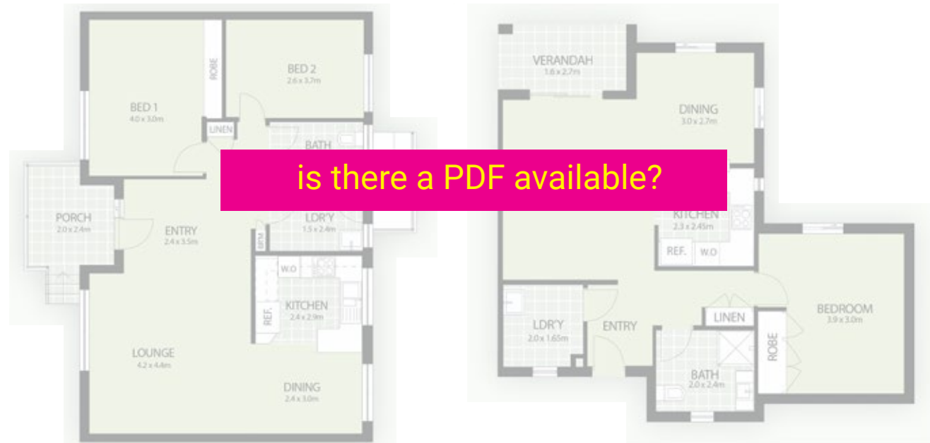
2 Bedroom Villa